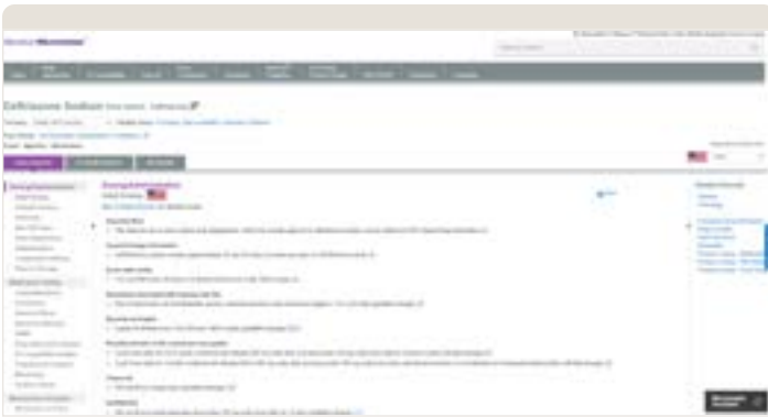
Figure 1: Formulary status displayed in the drug monograph